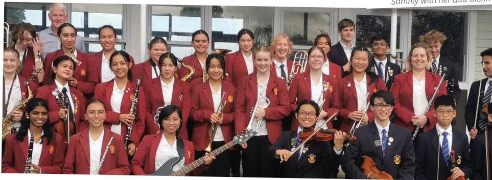
Bronze medal winners - The Saints